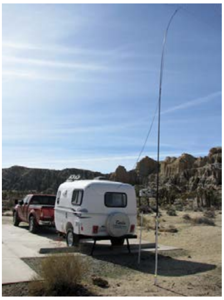
Figure 2. 20-foot Wonderpole

Installation was completed within an hour. The fishing pole method worked well in an area with no natural support structures.