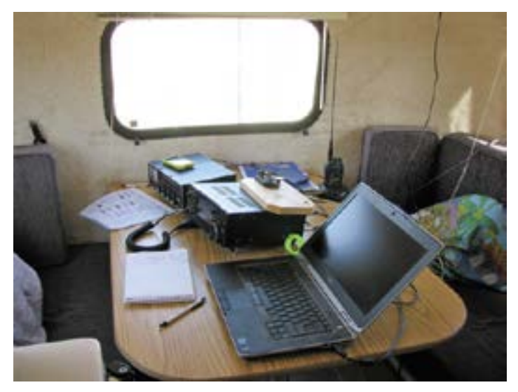
Figure 1. Station

While returning from Quartzfest in AZ with a Casita travel trailer in tow, I detoured to a campground northeast of Mojave, CA to participate in Winter Field Day 2019 for my first time. This event seasonally mirrors Field Day to allow hams to deploy during a potentially harsh winter month.