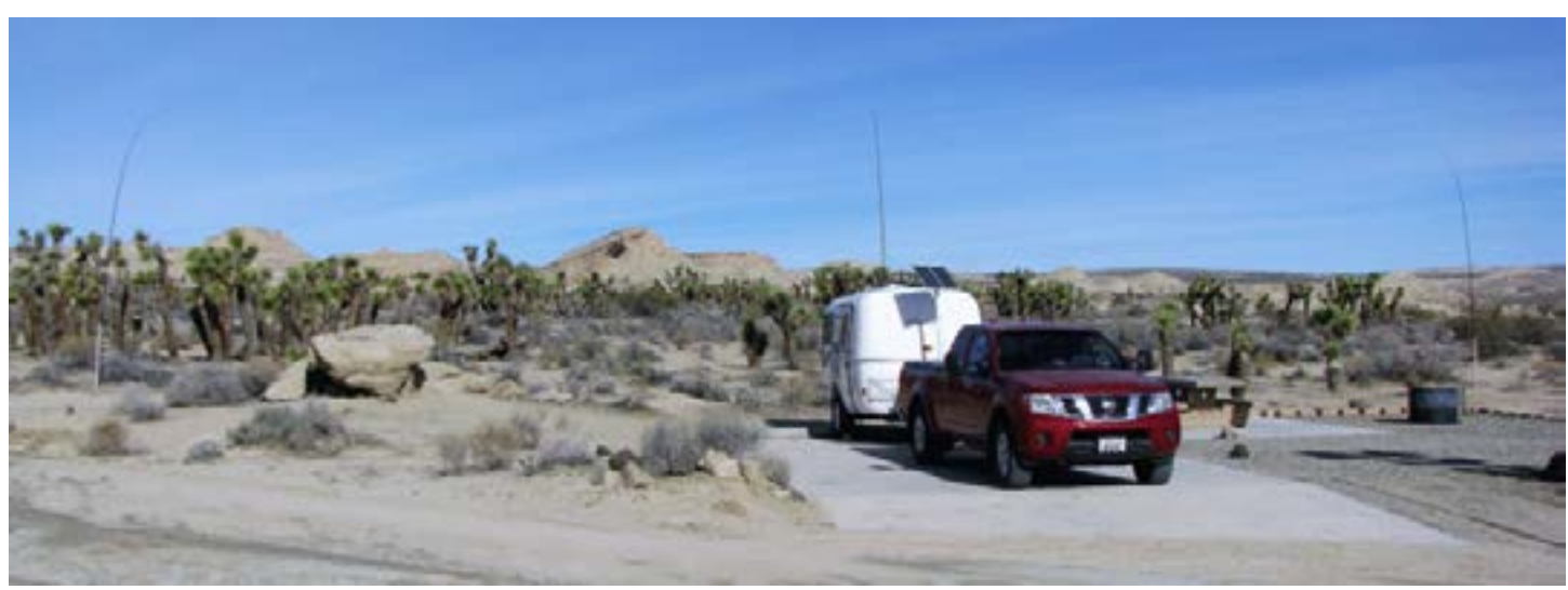
Figure 3. Modified NorCal Doublet antenna

I thoroughly enjoyed my first Winter Field Day operating experience. Give it a try if you can.