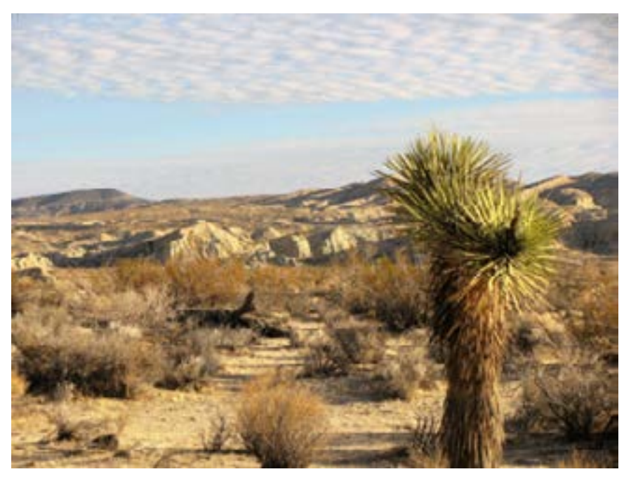
Figure 5. Outstanding scenery